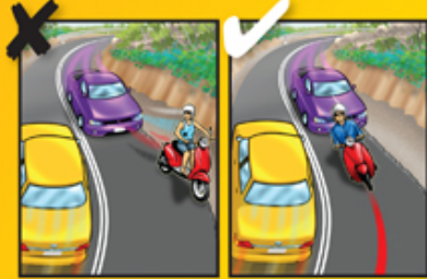
Take your time and don't panic around other cars