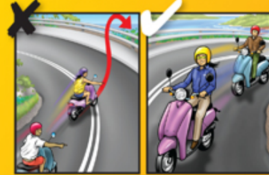
Where you look is where you go!

For emergencies call: Triple Zero (000) For more information go to: police.qld.gov.au