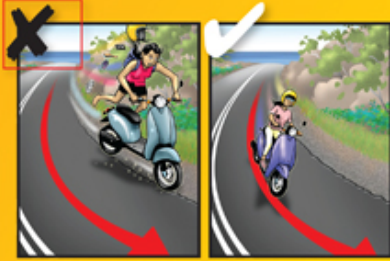
Stay in the middle of your lane - NOT at the edge