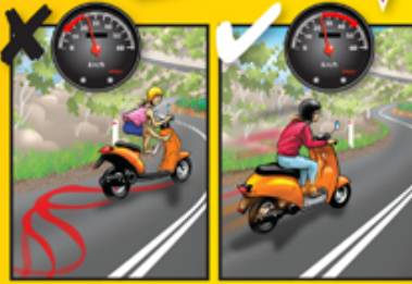
Ride at 25kph+ up hills