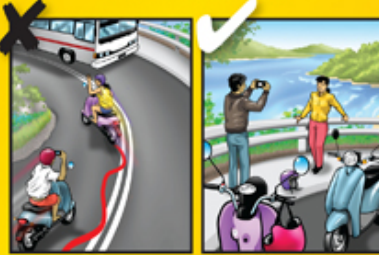
Use both hands - stop and pull over to take photos